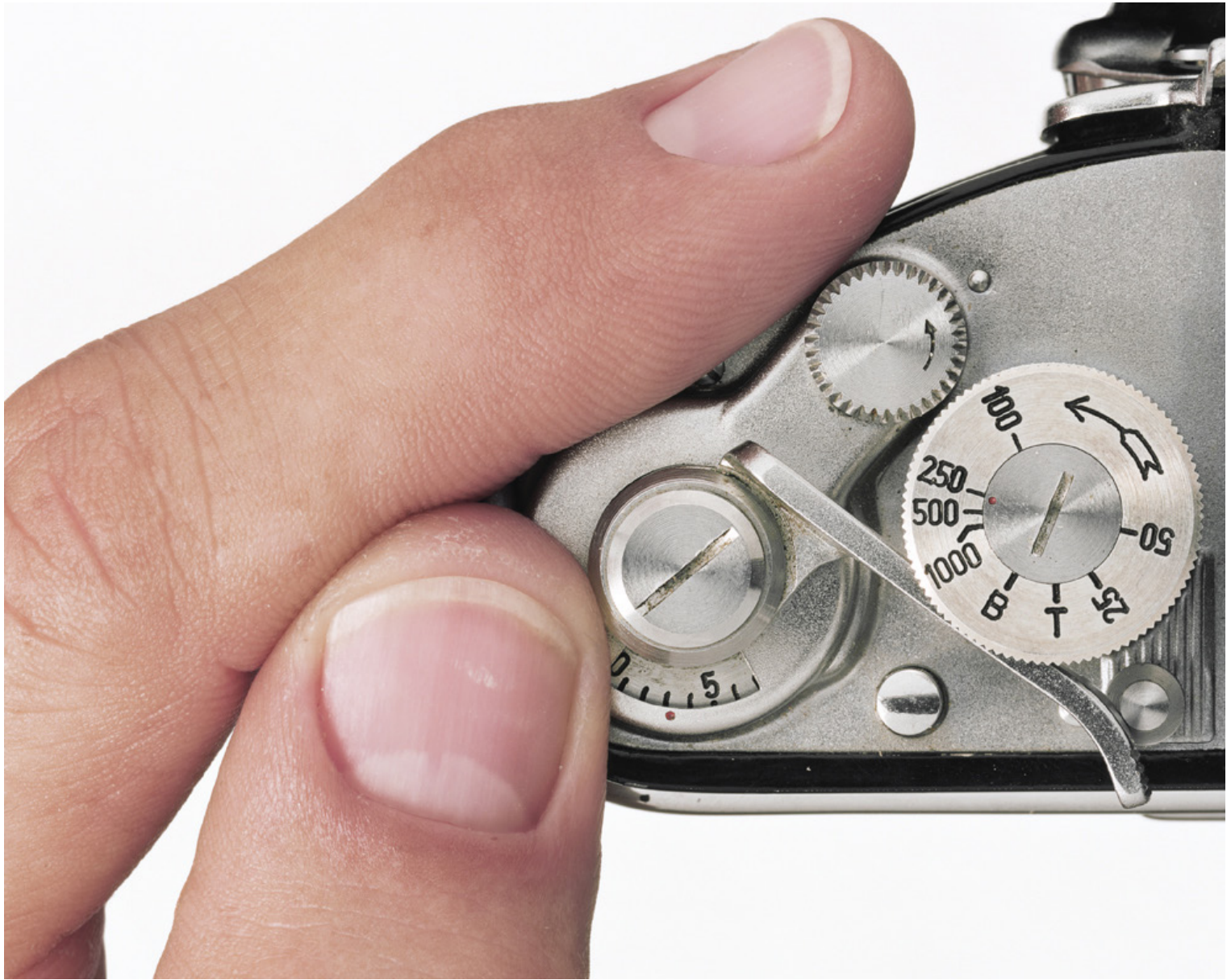
Fig. 7: Turning the exposure counter knob Exakta Varex IIa