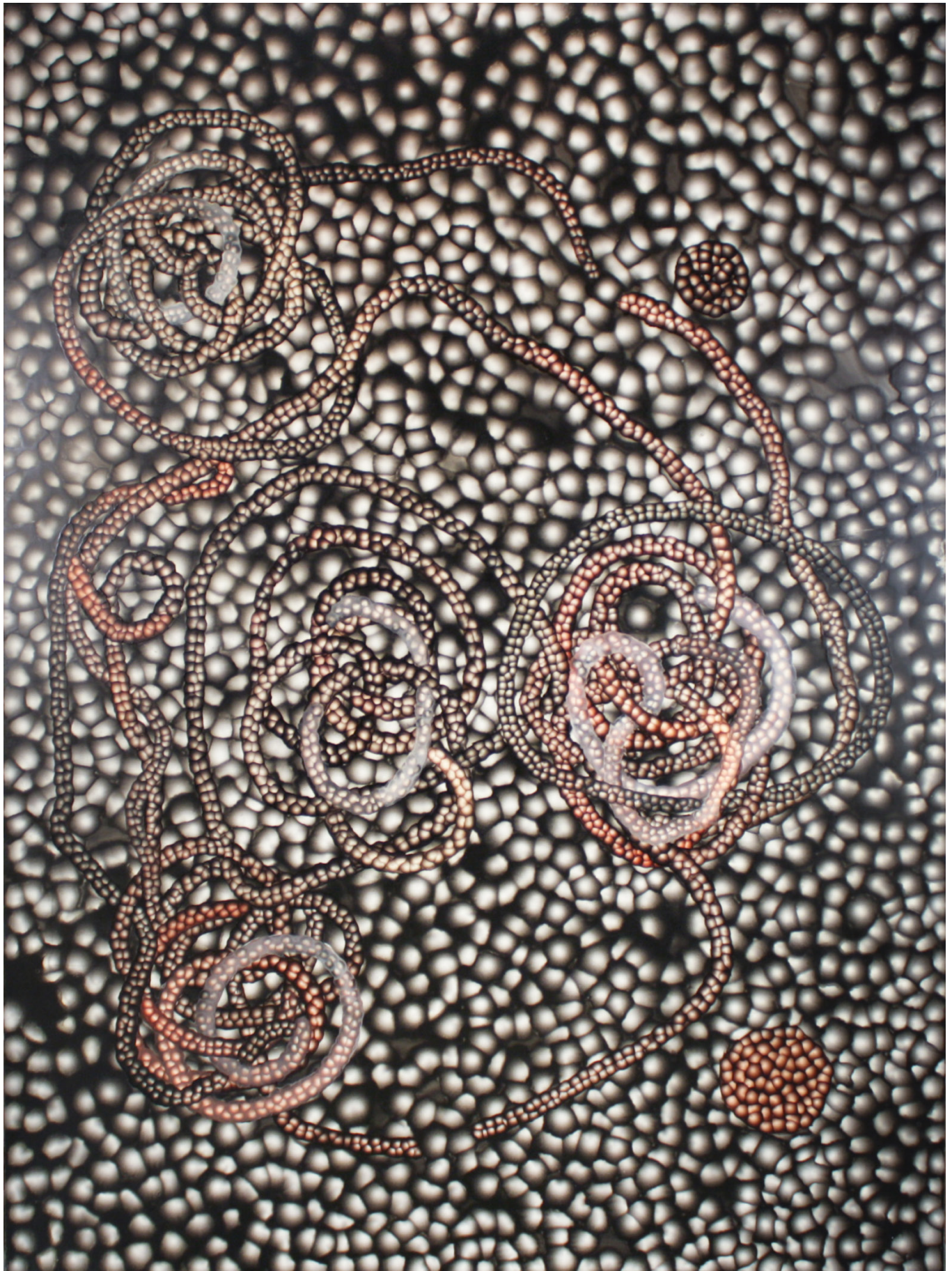
Ross Bleckner Selective Behavior , 1999 Oil on linen 84 x 60 in 213.4 x 152.4 cm