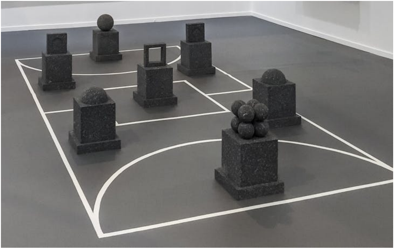
Untitled (7 Signs with City Chart) (1992), Matt Mullican.