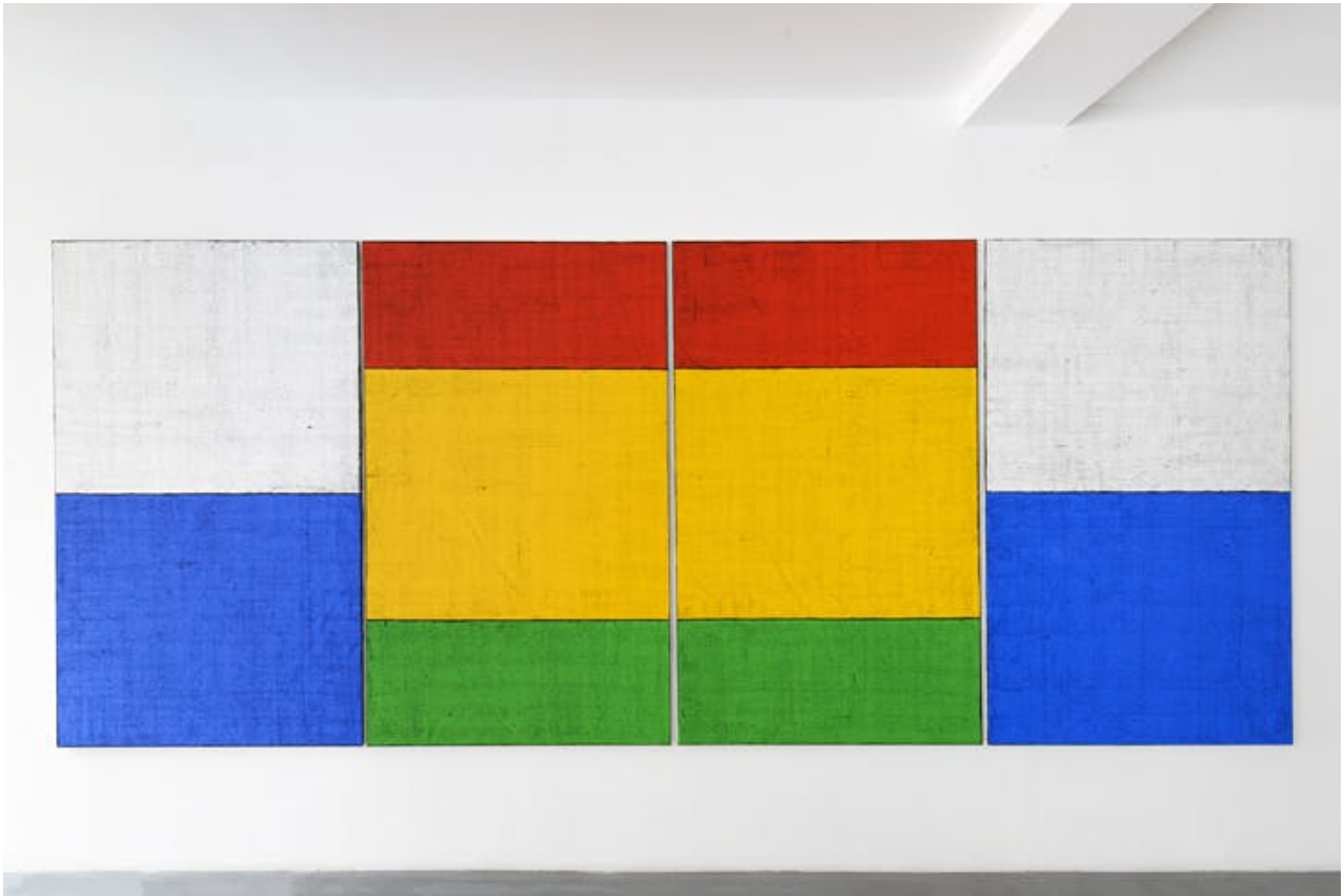
Overall Chart (2013), Matt Mullican.