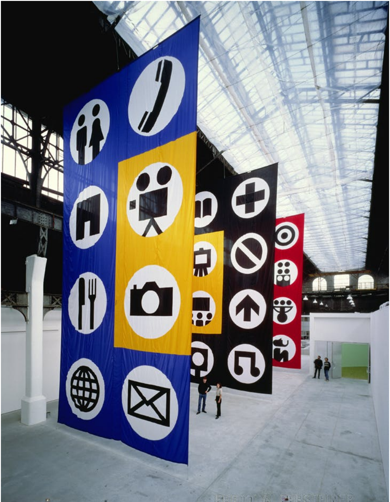
Le Magasin (1990), Matt Mullican. Installation view, Grenoble, 1990.