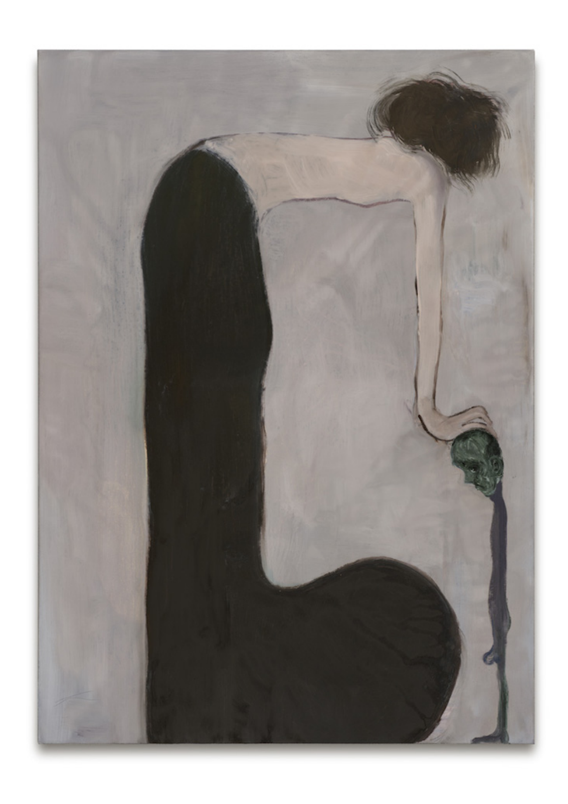
Sanya Kantarovsky: 'Booted,' 2024, oil on linen, 139.7 x 99.1 cm // Courtesy of the artist and Capitain Petzel, Berlin

Another artwork from the exhibition that lingered with me is Sanya Kantarovsky's 'Booted' (2024)—a painting of a woman doubled over, her legs and feet forming a colossal boot, while she supports herself using a diminutive male figure, leaning on him like a walking stick. The figures exhibit striking disproportion and a slightly grotesque quality in their portrayal, resembling the distinctive style of an Egon