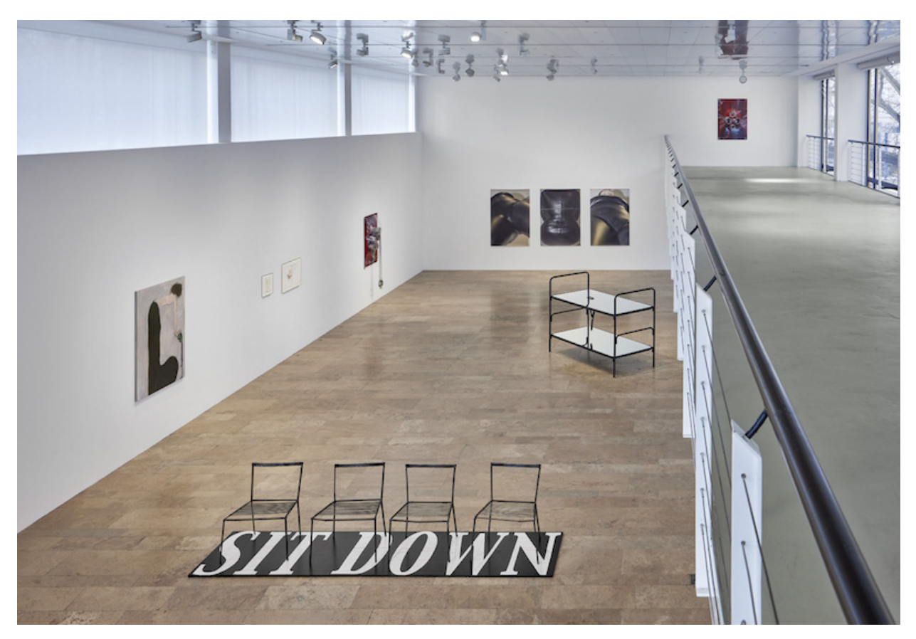
'Non-Specific-Objects,' 2024, installation view, Capitain Petzel, Berlin

In 1964, Donald Judd wrote the essay 'Specific Objects,' a key text in the development of Minimalist art theory. In his essay, Judd articulated his ideas on art and objects, advocating for a shift away from traditional forms of artistic expression. He emphasized the importance of the physical presence and materiality of art objects, rejecting representational and symbolic content. He introduced the term "specific objects" to describe artworks that exist as self-contained entities, challenging the conventional boundaries between painting and sculpture. He argued for an art that was devoid of narrative or illusionistic elements, aiming for a direct and immediate experience for the viewer.