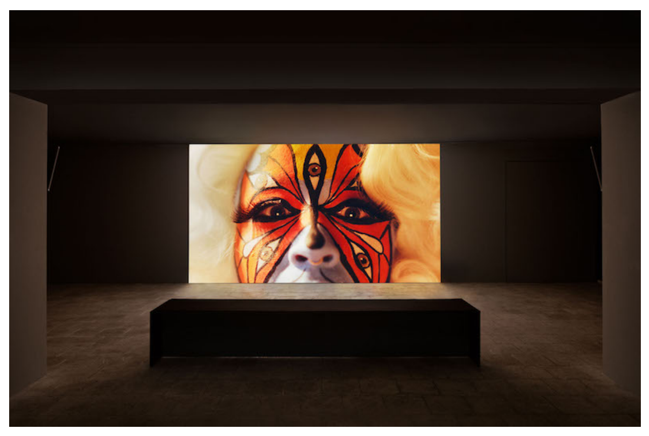
'Non-Specific-Objects,' 2024, installation view, Capitain Petzel, Berlin

One of the most notable pieces featured in the exhibition is 'Dreaming the End' (2023), a 21-minute video by the non-binary artist Sin Wai Kin, which serves as an intimate exploration of the artist's personal experiences with binary categorizations. I was, coincidentally, present for the premiere of the work in Rome, and it seemed truly fitting to rediscover it within the context of this exhibition. Sin's work, particularly in this piece, actively challenges the hegemonic universal, namely as their characters navigate between gender binaries, occupying spaces at both ends of the spectrum and the places in between. In 'Dreaming the End,' Sin flaunts an array of costumes, ranging from sophisticated three-piece suits to extravagant ball gowns. Through these transformations, the artist embodies a diverse cast of characters that spans the (stereotypical) gender spectrum, establishing a space that not only celebrates but actively embraces diversity and difference.