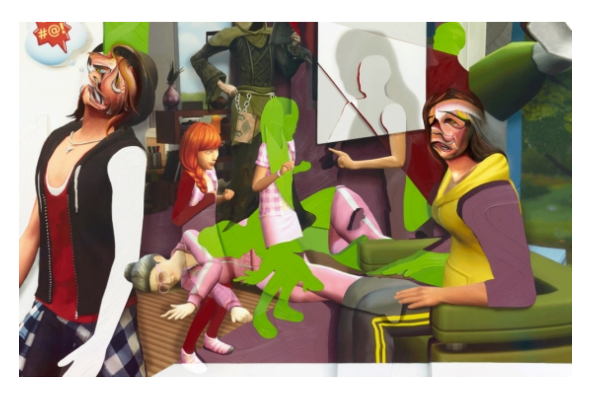
Petzel Gallery September 03, 2020 - October 31, 2020

JIX juxtapoz.com/news/painting/shifted-sims-a-conversation-with-pieter-schoolwerth