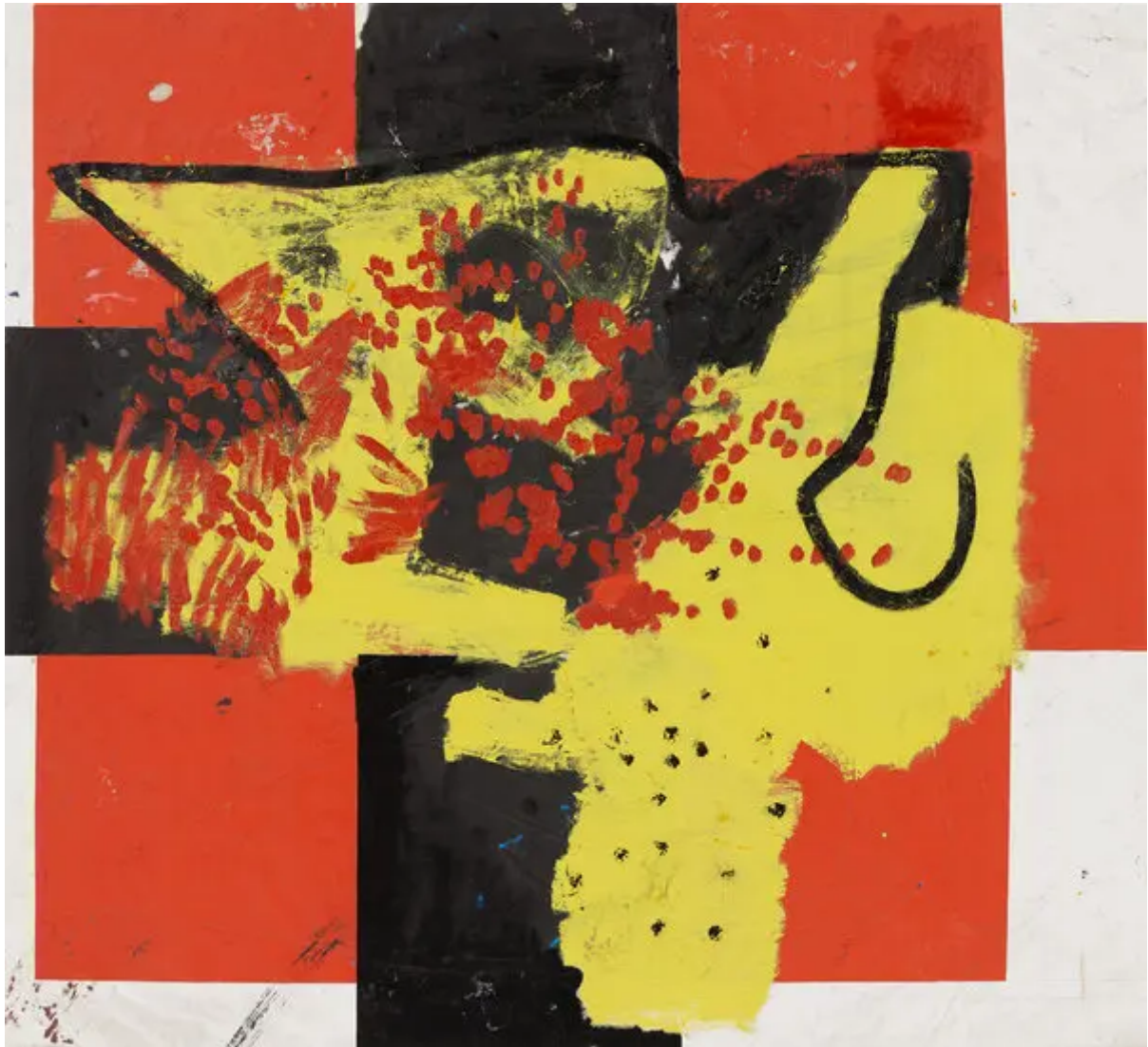
"Cameo," 2022, whose center "is a skirmish of bright yellow, jabs and dots in red and two black lines."

Art history is evoked obliquely. Toward the center of "Fool's Errand," a rectangle of dark blues brightened by some white dots floats above a field of red; it's a Monet in a box.