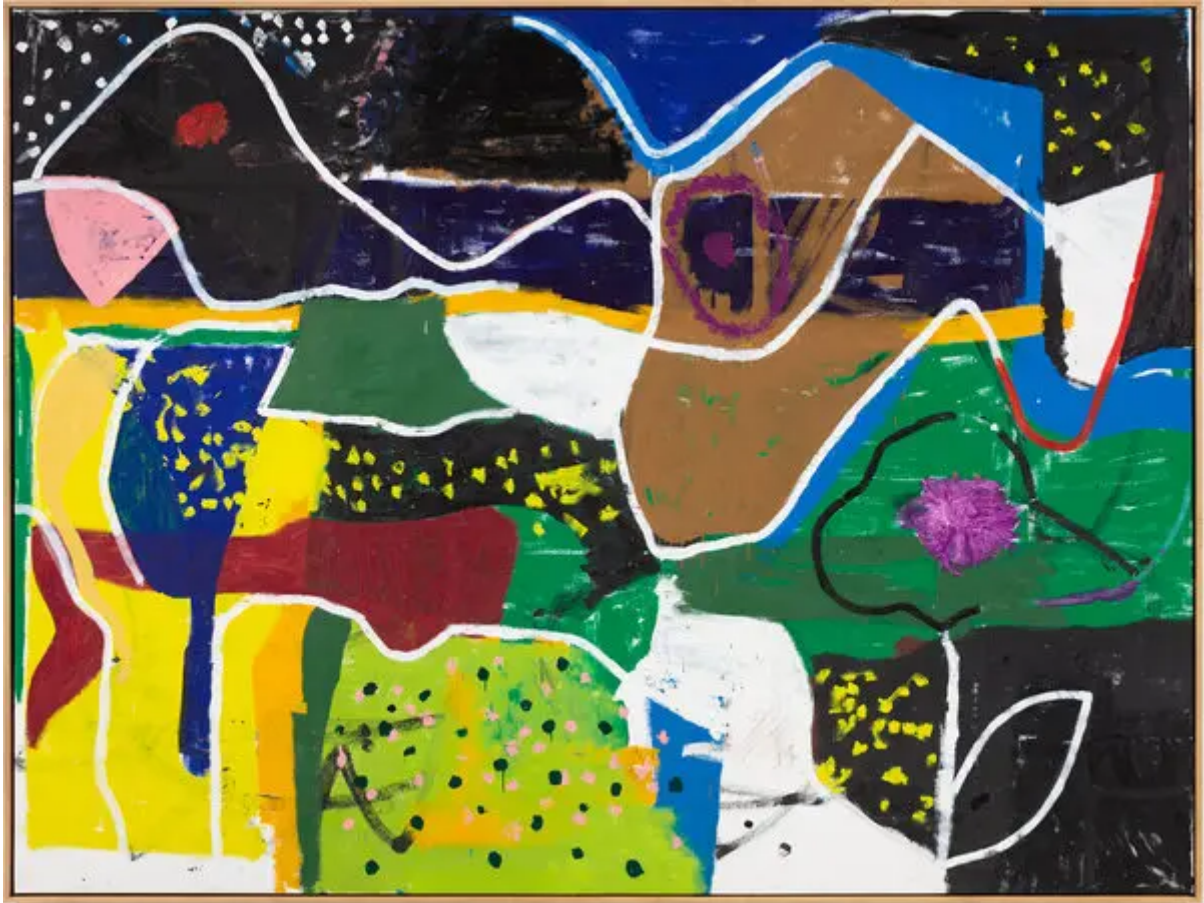
"Jubilee," 2022, in which "three fields of different greens and two mountains wobble between flat and deep."

Then came a transitional phase during which Bradley started applying paint with a wide brush to dirty canvases whose footprints and paint drips were part of the composition. These were rough and beautifully scaled. But the play of intention against accident was familiar, from somewhere between Julian Schnabel and Abstract Expressionism.