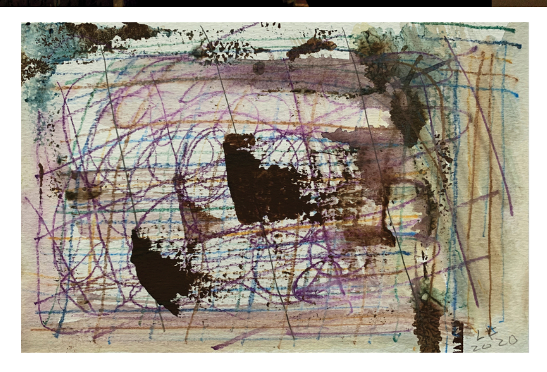
Louise Fishman , Untitled , 2020 , watercolor, color pencil, and pencil on paper, 6 \times 9 ".