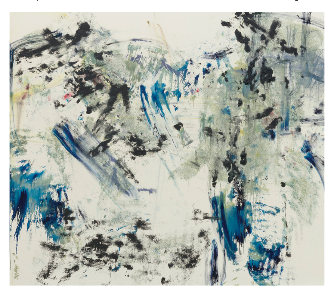
Louise Fishman, Like Air I'll Rise , 2018, oil on linen, 74 × 86".

That was her kind of politics and her kind of love: Start with your own struggle, look to the surrounding world to figure out your community, work out your relational lifelines by means of what you love, maintain an attitude of remembrance but noncompliance.