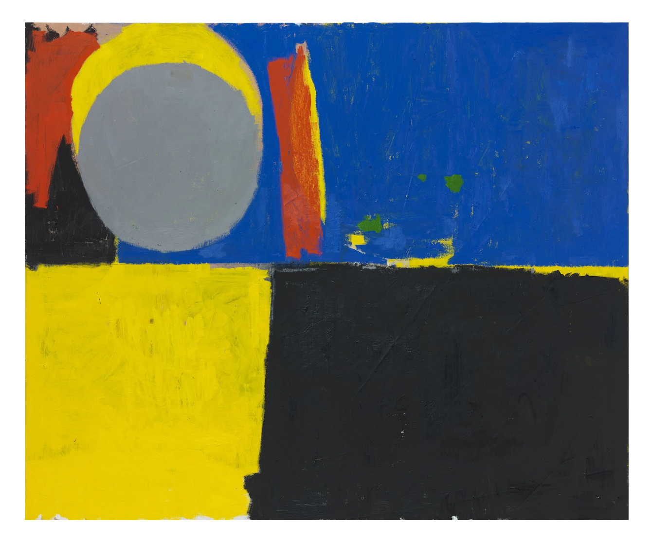
Joe Bradley, Mother and Child , 2016. © Joe Bradley.

I feel like you reconsider older styles in your work, but I don't feel as if you're regurgitating them. To me, it's like you're looking back at older periods in art and saying "this isn't what we've come to think it is." It's like you penetrate periods in art that we've come to aggrandize and bring them back into reality.