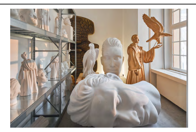
View of "Redemption Now" Jüdisches Museum Berlin, 2021