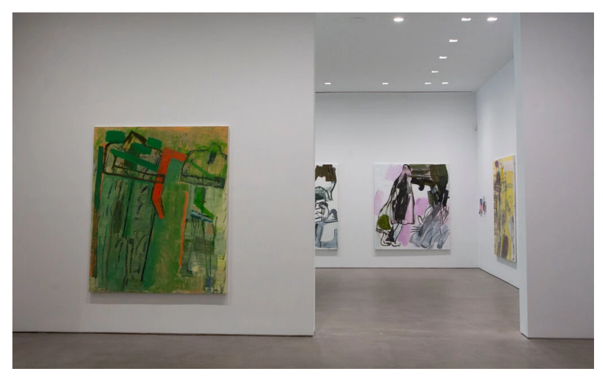
At Gladstone Gallery, from left, "Split 4," "20206," "20204," "Untitled," "Untitled," and "Split," all from 2020.

She's pinned 18 of these floral still lifes all together on a single wall. Others are placed, like punctuation marks, between the larger abstractions. "I wanted to place flowers around in the same spirit that you place flowers at a grave site," she explains. "It's an act of having a living thing that's a memento mori."