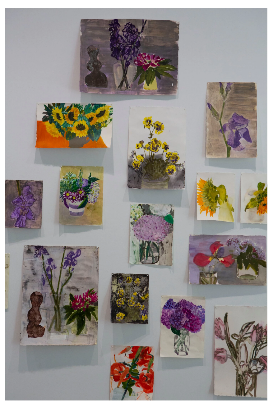
These floral still lifes, all untitled, from 2020, were painted at her Long Island retreat during lockdown. "We were all thinking we were going to die," she said, "and spring was just carrying on."

Faldbakken, David Salle) of artists who can really write . The evidence is in "Faux Pas," a just-published collection — her fourth — of her writings that display the same good humor and intelligence of her best paintings. It also offers some great new coronavirus-themed cartoons, in which Ms. Sillman depicts herself strung out and wire-haired, worrying equally about quarantine weight gain and planetary self-destruction.