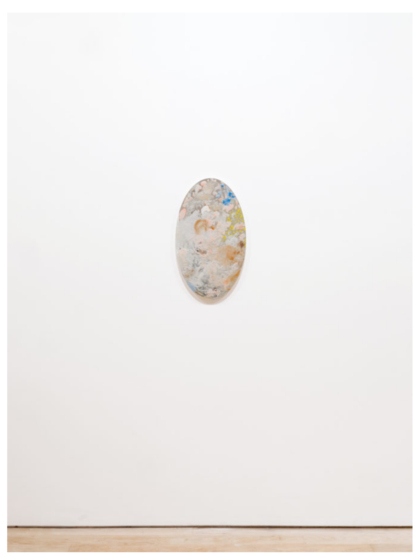
Karla BlackLooking Glass number 7, 2021.Mirror, glass paint